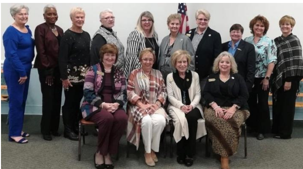
DAC with Pilot Club Members Attending