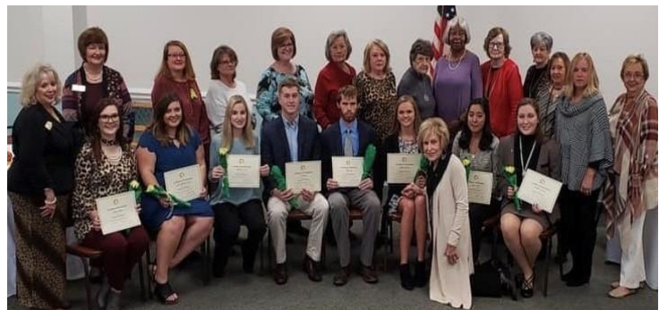
DAC with Troy Compass Club