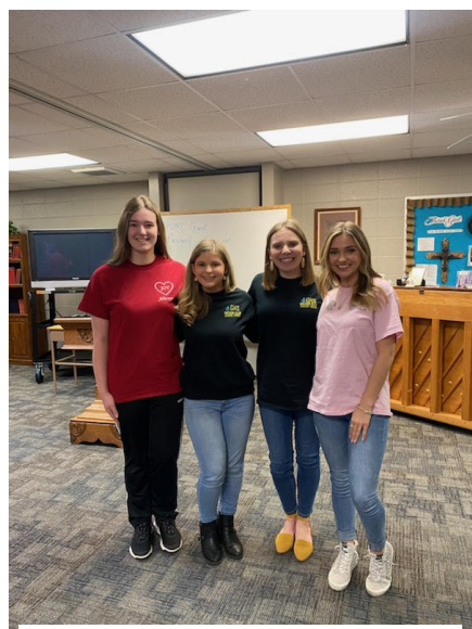
2020-2021 Alabama District Anchor Officers