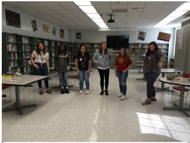
Handley High School Watch Party