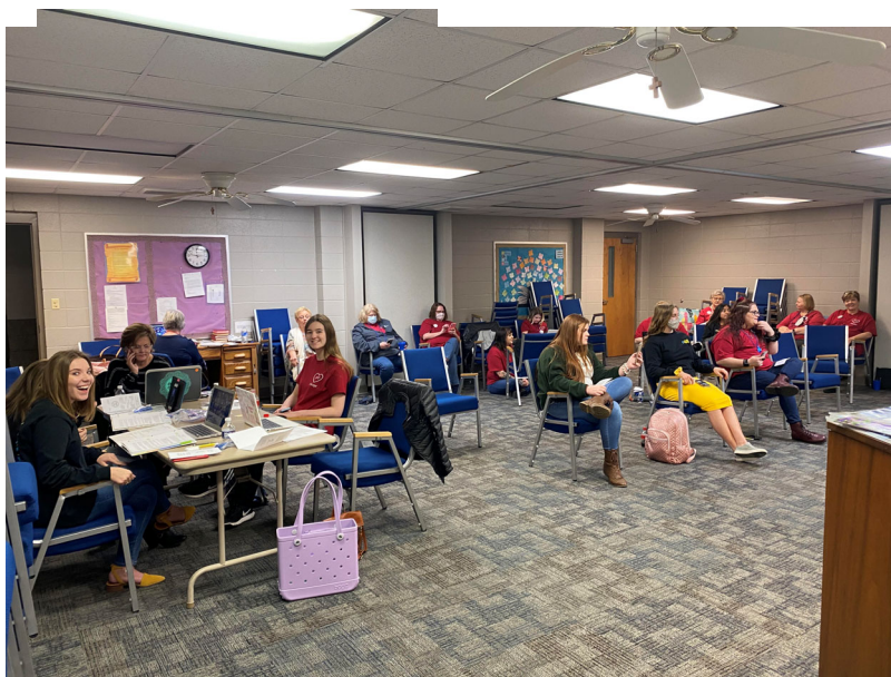
Hokes Bluff and DAAC Watch Party