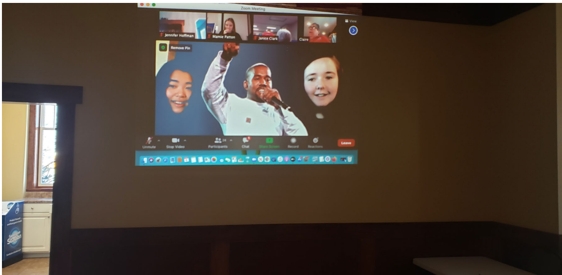
Andalusia High School Watch Party! They rocked the backdrops!