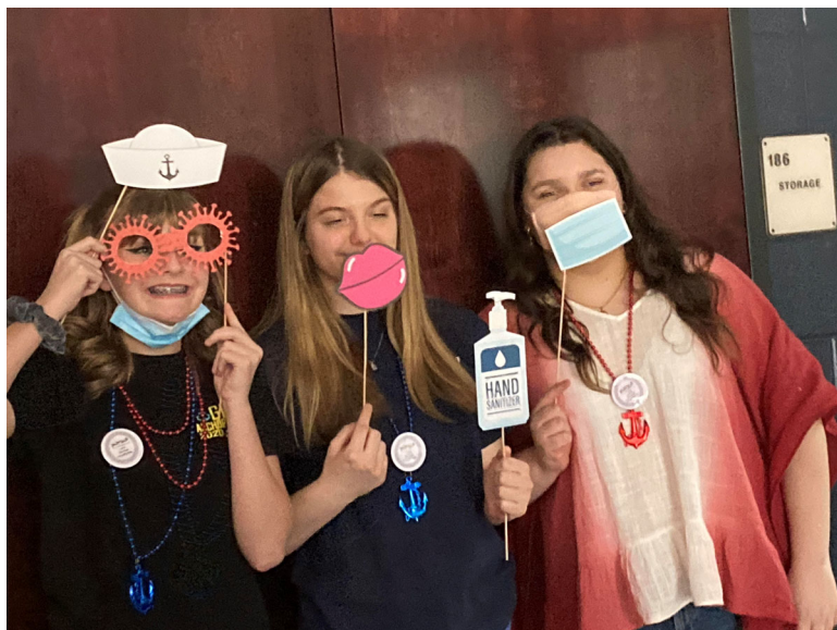
Guntersville Middle/High School Watch Party