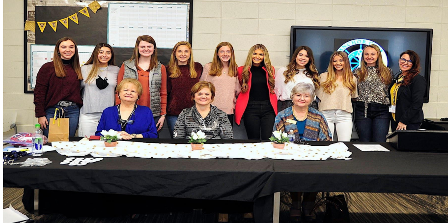
Jasper High School Anchor Club

The Alabama Anchor District now has 2 new clubs!! Jasper High School Anchor Club was chartered the morning of February 25 th . They have 11 members and are sponsored by the Pilot Club of Jasper. The Hope United Academy Anchor Club was chartered in the afternoon on February 25 th . They have 10 members and are sponsored by the Pilot Club of Huntsville. Congratulations Anchors and Pilots!