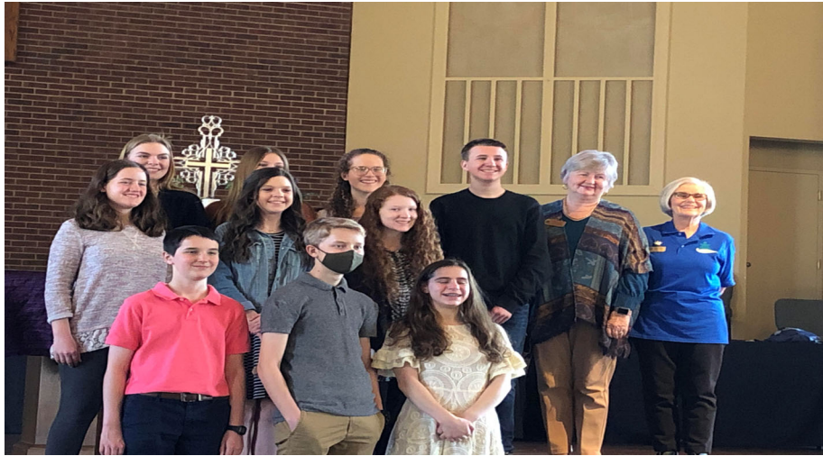
Hope United Academy Anchor Club