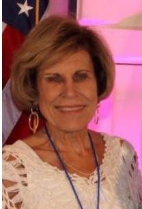
Kay Chandler Governor