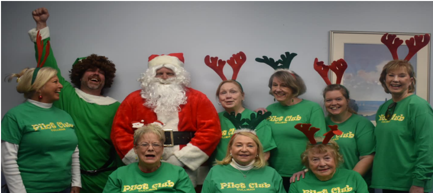
Cullman Pilots held their Annual Christmas Part at the Margaret Jean Jones Center. Bags of candy were distributed to the clients and staff.