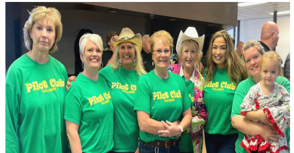
Cullman Pilots served close to 1700 meals to the children at the Cullman County Sheriffs Rodeo.