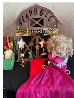
This is Piggy Parton from PC of Enterprise, the plumpest pig.