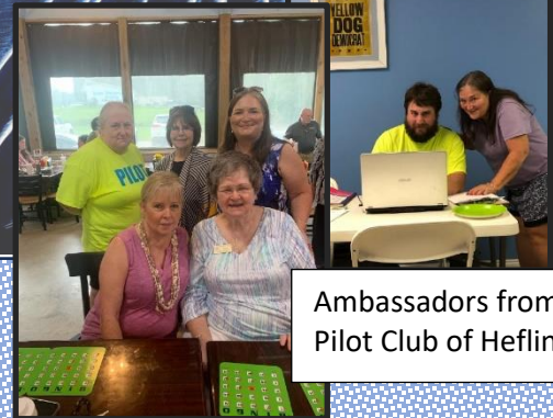
Ambassadors from Pilot Club of Heflin