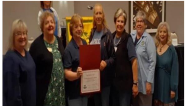
PILOT CLUB OF LEE COUNTY