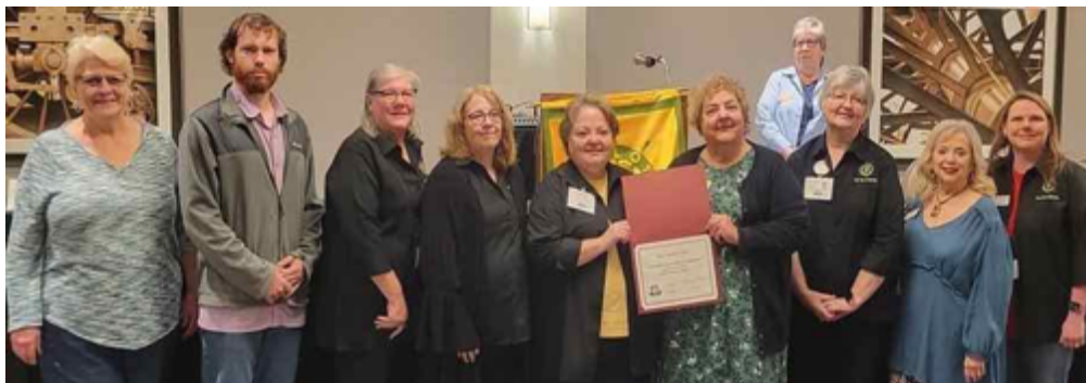
PILOT CLUB OF PRATTVILLE