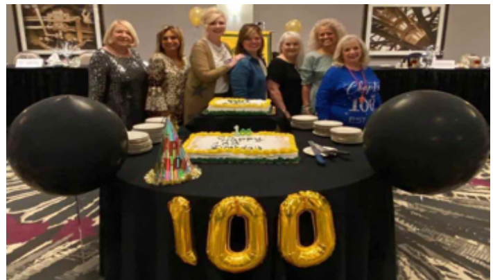
Pilot Club of Cullman