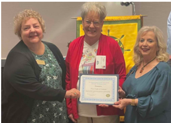
PILOT CLUB OF CULLMAN