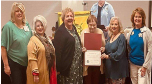
PILOT CLUB OF ANDALUSIA