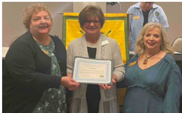
PILOT LUNCHEON CLUB OF MORGAN COUNTY