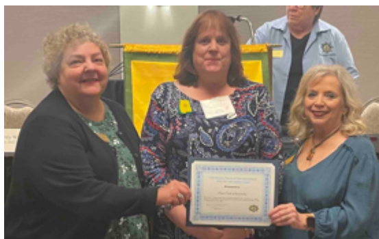
PILOT CLUB OF ROANOKE