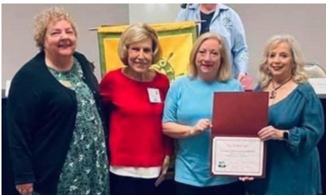
PILOT CLUB OF DECATUR