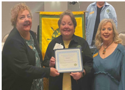
PILOT CLUB OF PRATTVILLE