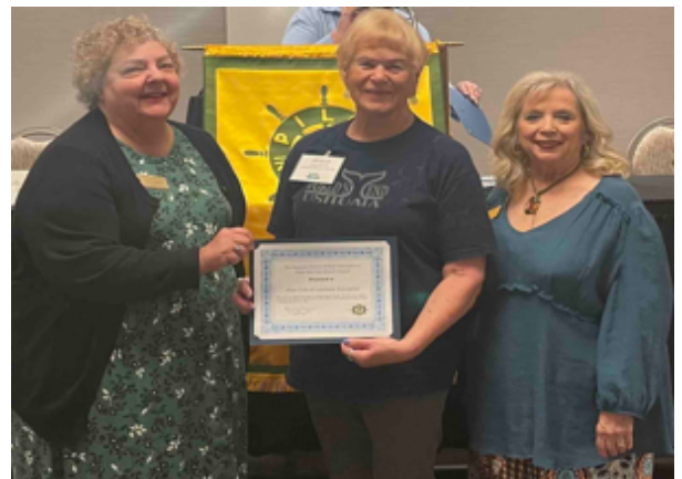
LUNCHEON PILOT CLUB OF ENTERPRISE