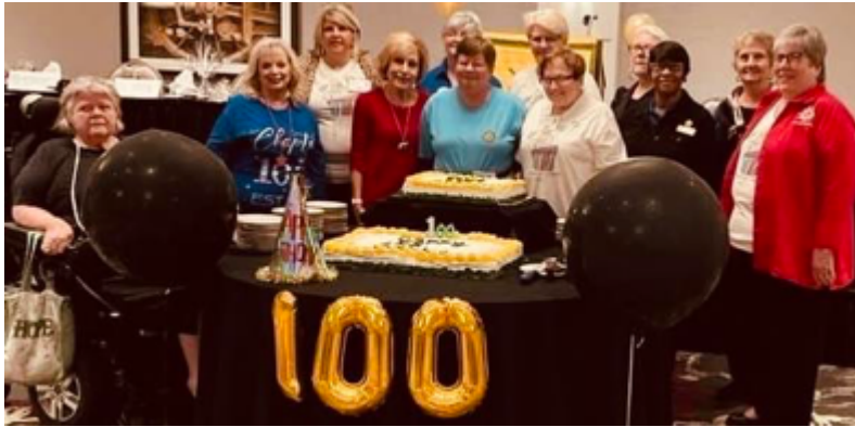
PAST DISTRICT GOVERNORS AND PAST INTERNATIONAL PRESIDENT