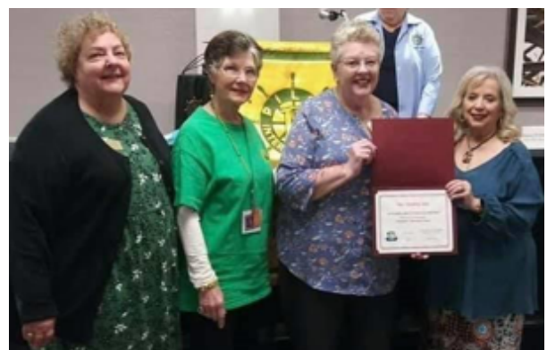
PILOT CLUB OF DEMOPOLIS