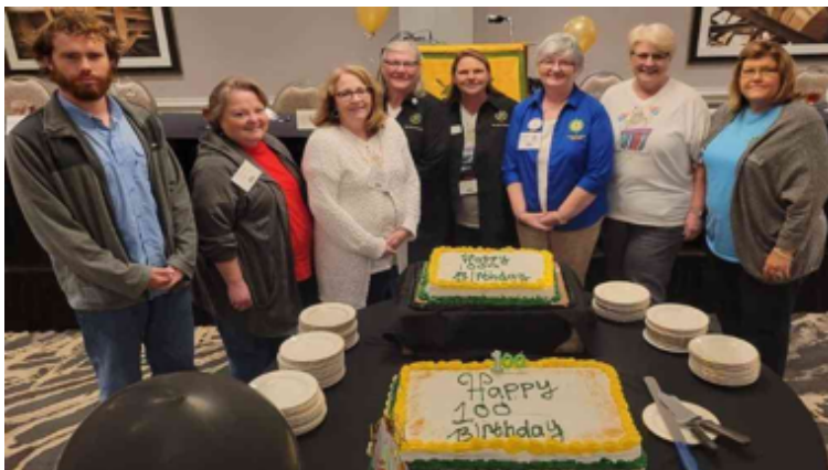
Pilot Club of Prattville